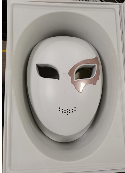
Fig.3-2 Title 图名